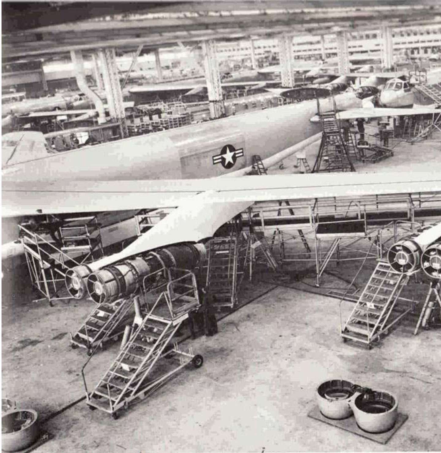
Here 277 B-52s are being produced where the earlier airplanes once were assembled.