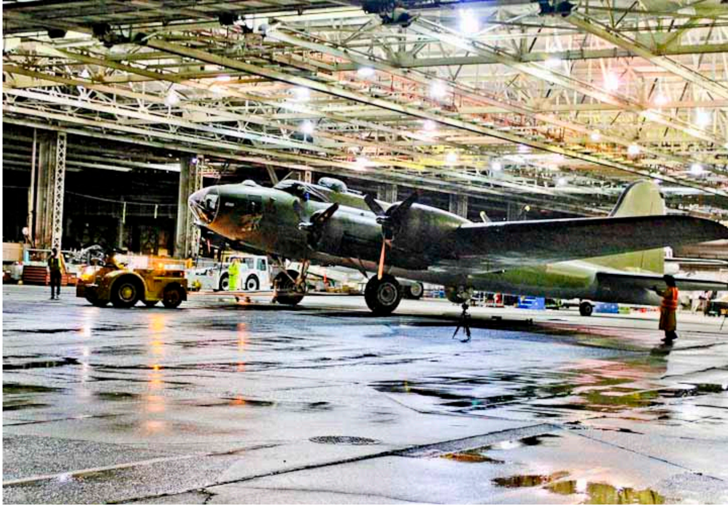
A poignant moment in time